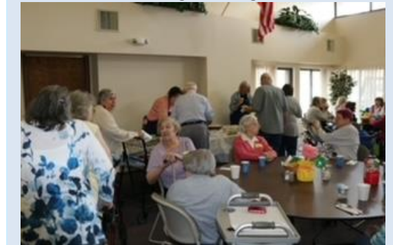
A Good Time