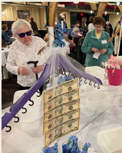
Raffle prizes included 6 chances to win $50 in cold, hard cash.