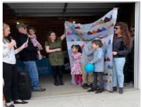
The family received a new Habitat home and a quilt given to them by the BCCWC on April 9. The mother works as a family support specialist in the child welfare field. She is also a full-time college student.