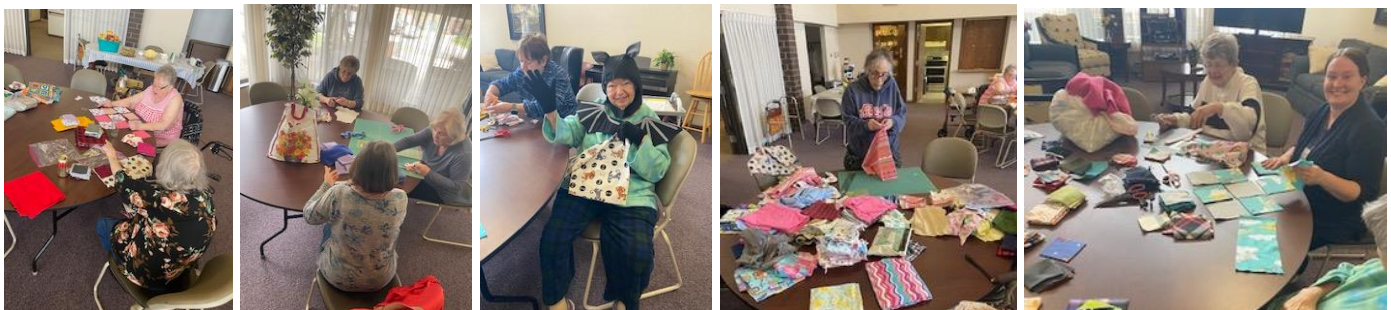
BCCWC Members and Fort Howard Apartment residents – Misfits preparation

A “sharp” group of “cut ups” including 8 BCCWC members and 12 Fort Howard Apartments residents volunteered on April 18 from 1-3PM to prepare fabric for the Misfits. Participants sorted, cut, and assembled complementary squares and backing for the mini quilts which will be distributed along with each Lovable Misfit. Some volunteers cut fleece for the Misfit bodies. Gallon Ziploc bags were donated to store finished Misfits and /or kits at the workshop for a later date.