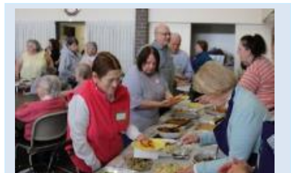
Buffet & Guests

Twelve enthusiastic BCCWC volunteers shared food and fun with 40 residents and staff at Fort Howard Apartments on Thursday, April 11. Generous members prepared a variety of casseroles, salads and desserts for the buffet. Following the meal, interested residents played bingo for an hour. Winners were delighted to choose from an array of prizes donated by BCCWC members. Many residents commented on how much they anticipate the events sponsored by BCCWC. Thank you to all members who donated prizes, prepared food and volunteered at the event. Please see the 2024-25 BCCWC Directory for upcoming events with Fort Howard residents.