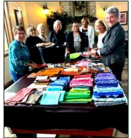
At the May quilters' meeting, members and guests peruse fabric that was donated to quilters for Habitat

“I am a single mother, and I have always told my children that we are a team. I consider my family humble, simple, and we live modestly. I am working on my children's values and their education and I have told them that as long as we have God in our hearts, nothing bad will happen to us and that is all we need. I love being home with my children and being in God's home.”