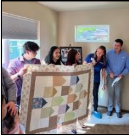
Another home – another quilt